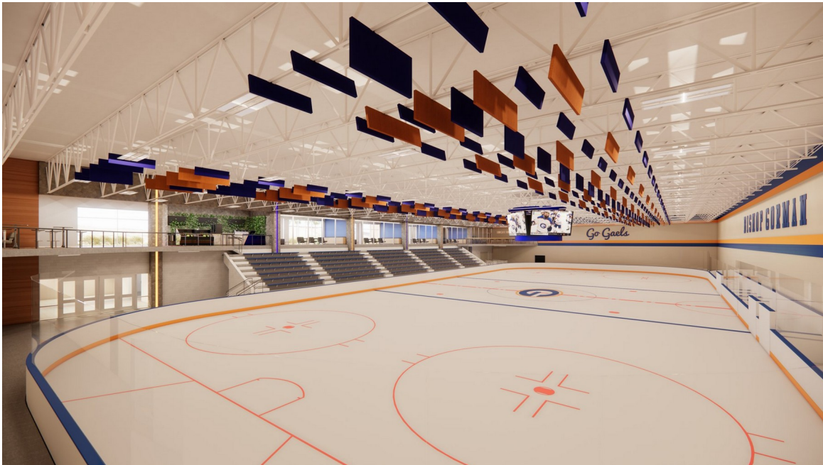
Rink Interior — On-Campus Concept

Designs are done. Funding is moving. The dream of a home rink on campus is closer than ever.